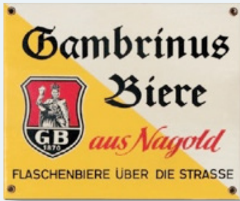
First customer Gambrinus, Nagold