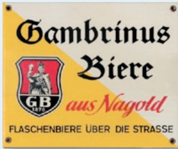
First customer Gambrinus, Nagold